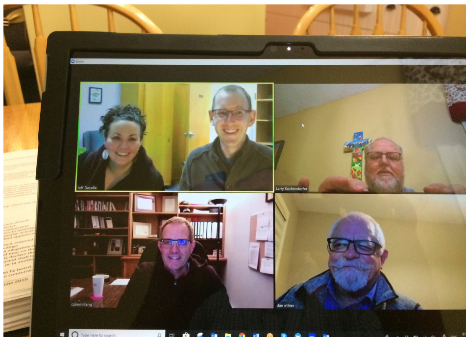
Area leadership teams regularly meet online.